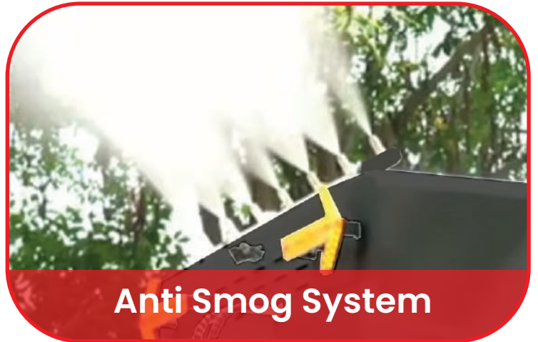
Anti Smog System