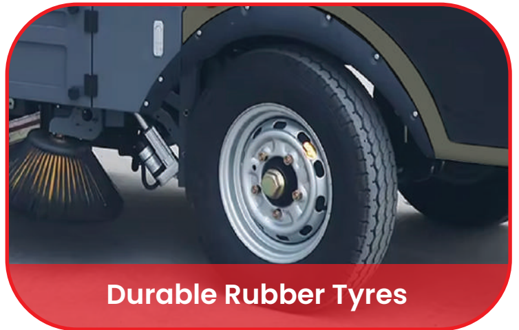
Durable Rubber Tyres