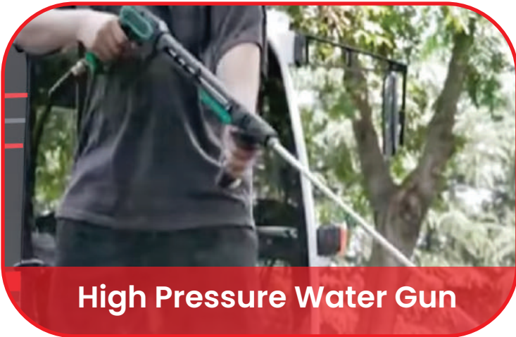
High Pressure Water Gun

From precision brushing to high-power vacuuming – every detail of DRS-2000 EV is built for next-level street cleaning.