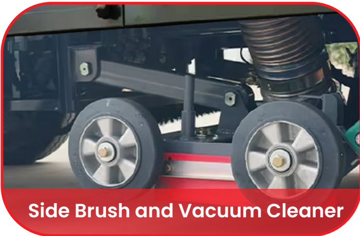
Side Brush and Vacuum Cleaner