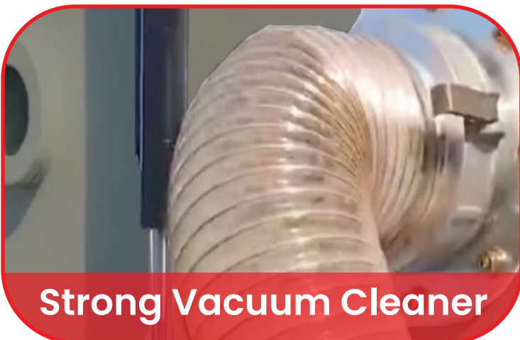
Strong Vacuum Cleaner