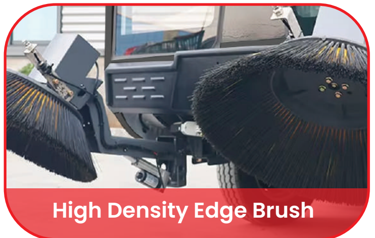
High Density Edge Brush